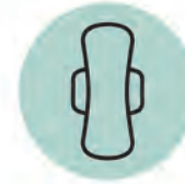
Feminine Care Products