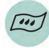
Protective Mattress Cover